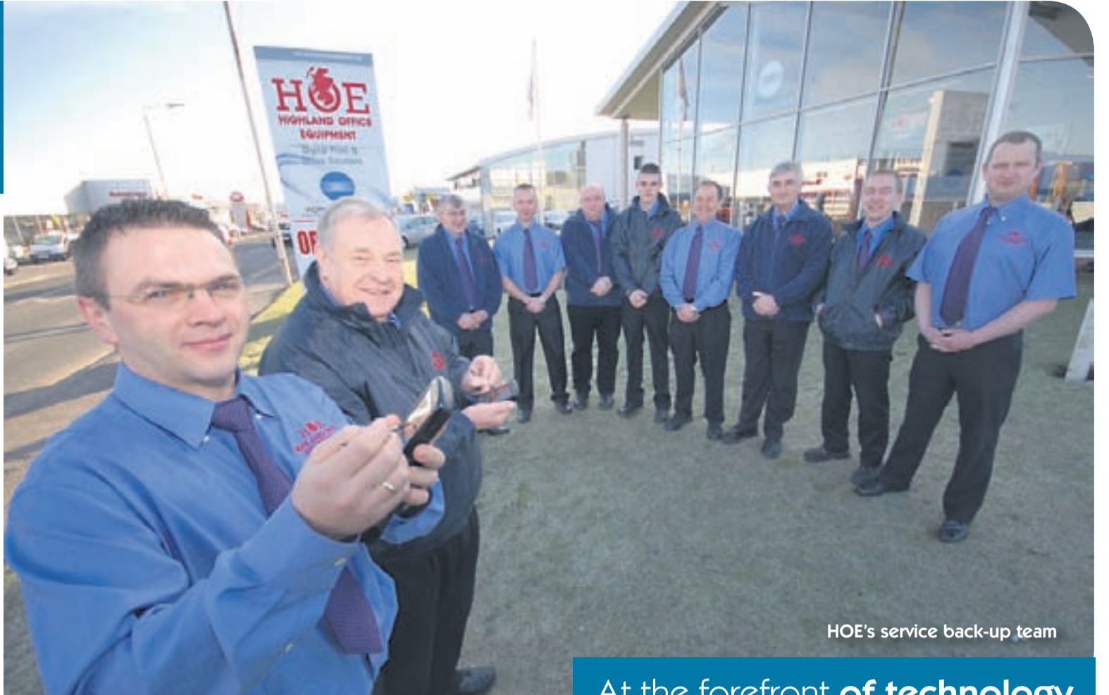
HOE's service back-up team